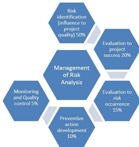
Figure 3. Management of risk analysis [6]

Risk management is the process associated to identification, risk analysis, and decision-making, which include maximizing the positive and minimizing the negative effects of risk events [6]. The project risk analysis management is include performance of general procedure indicated in Figure 3.