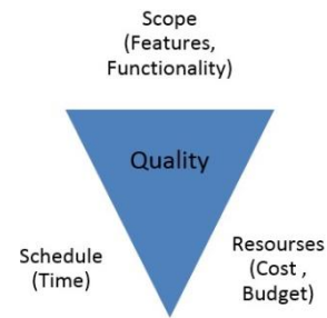
Figure 2. The iron triangle [5]

The time, cost and quality is the most important value of any design project. They are very closely related to each other. This relationship is called "The Iron Triangle" (Figure 2) [5].