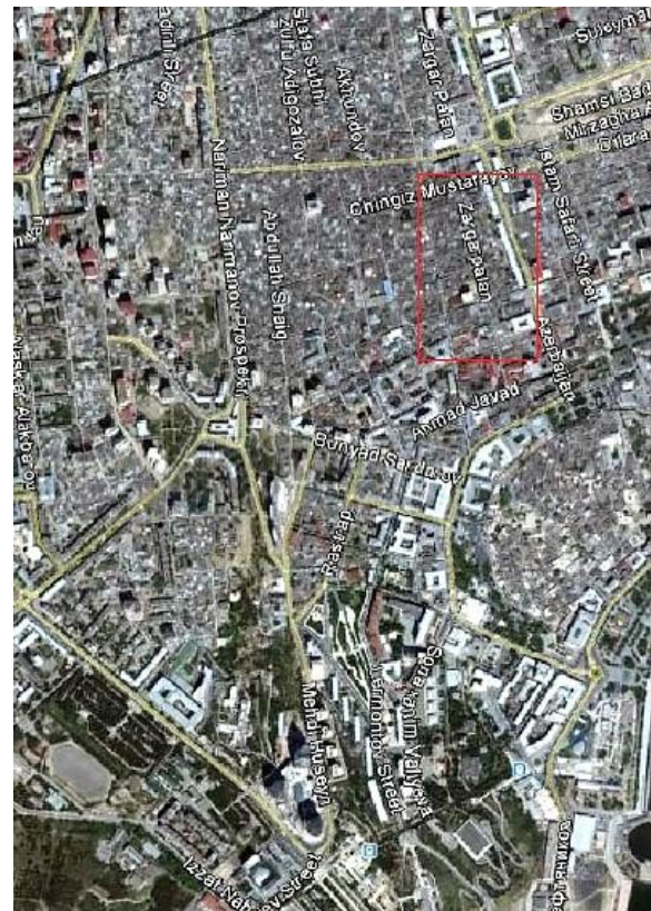
Figure 3. Space image data processing for selected street undertaken for regeneration

The street systems have crossing elements. There is a huge of communication system integrated and operating as whole system. It demands application of high accuracy modern technology advances to be able to consider all available data and management capability. The need for development of the GIS for street regeneration is also related for population protection in the selected area. On the studied within the streets along selected, "Murtuza Mukhtarov" and "Zargar Palan" are populated around 1220 people (Figure 3).